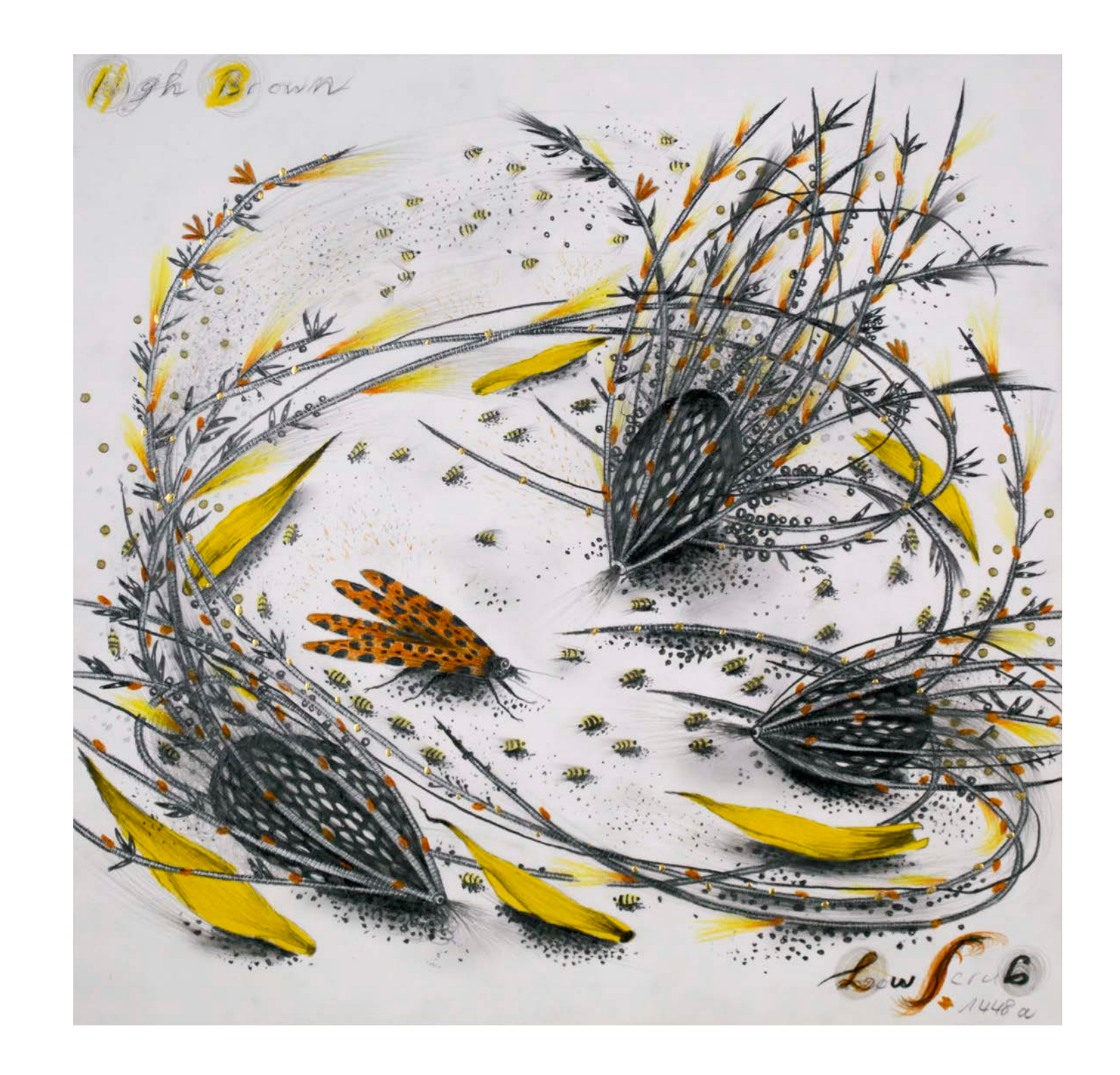
Hipkiss High Brown/Low Scrub, 2023 Graphite, silver ink, metal leaf and colored pencil on Fabriano 4 paper 25 x 25 cm | 9 3/4 x 9 3/4 in