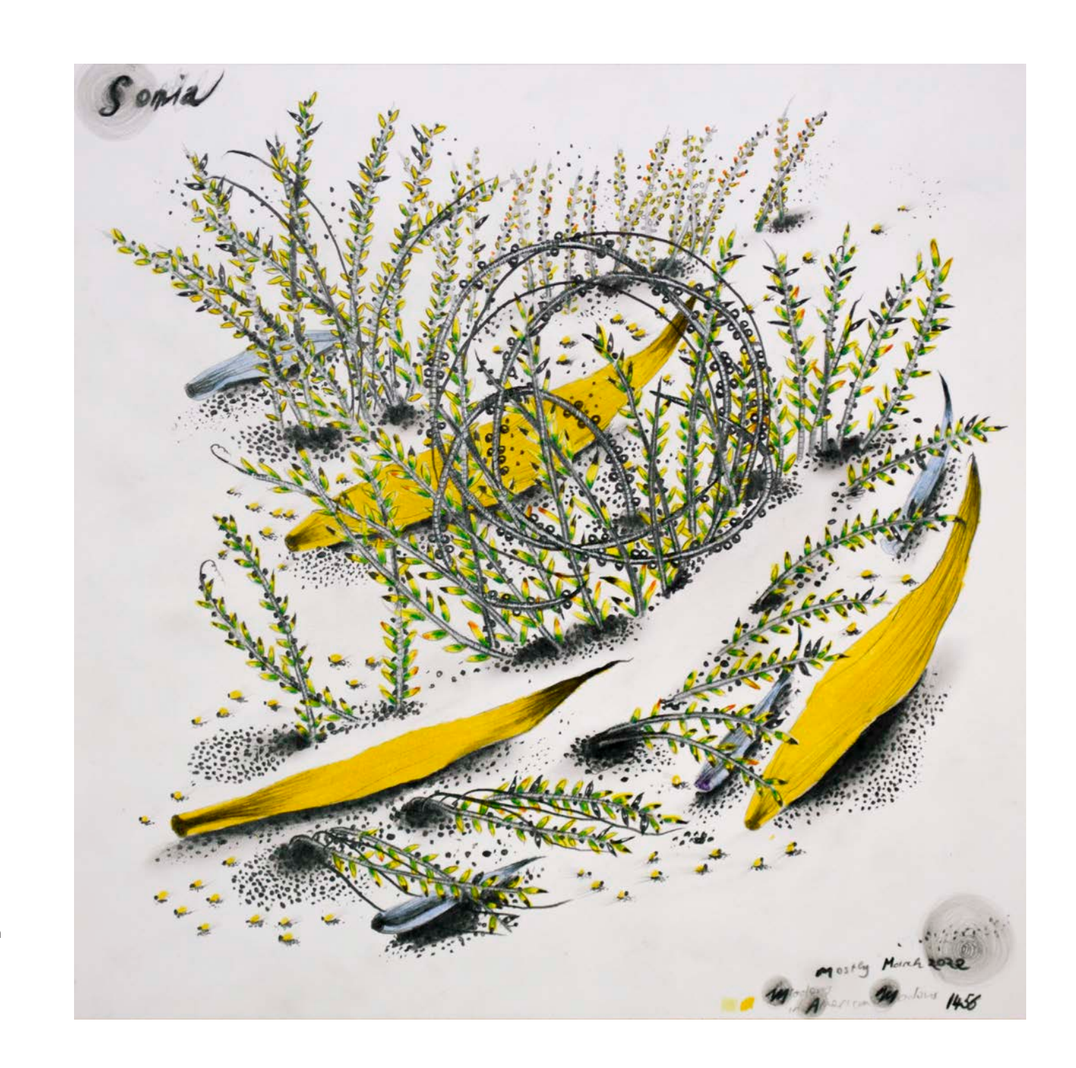
Hipkiss Meadows in the American Meadow , 2023 Graphite, silver ink, metal leaf and colored pencil on Fabriano 4 paper 25 x 25 cm | 9 3/4 x 9 3/4 in