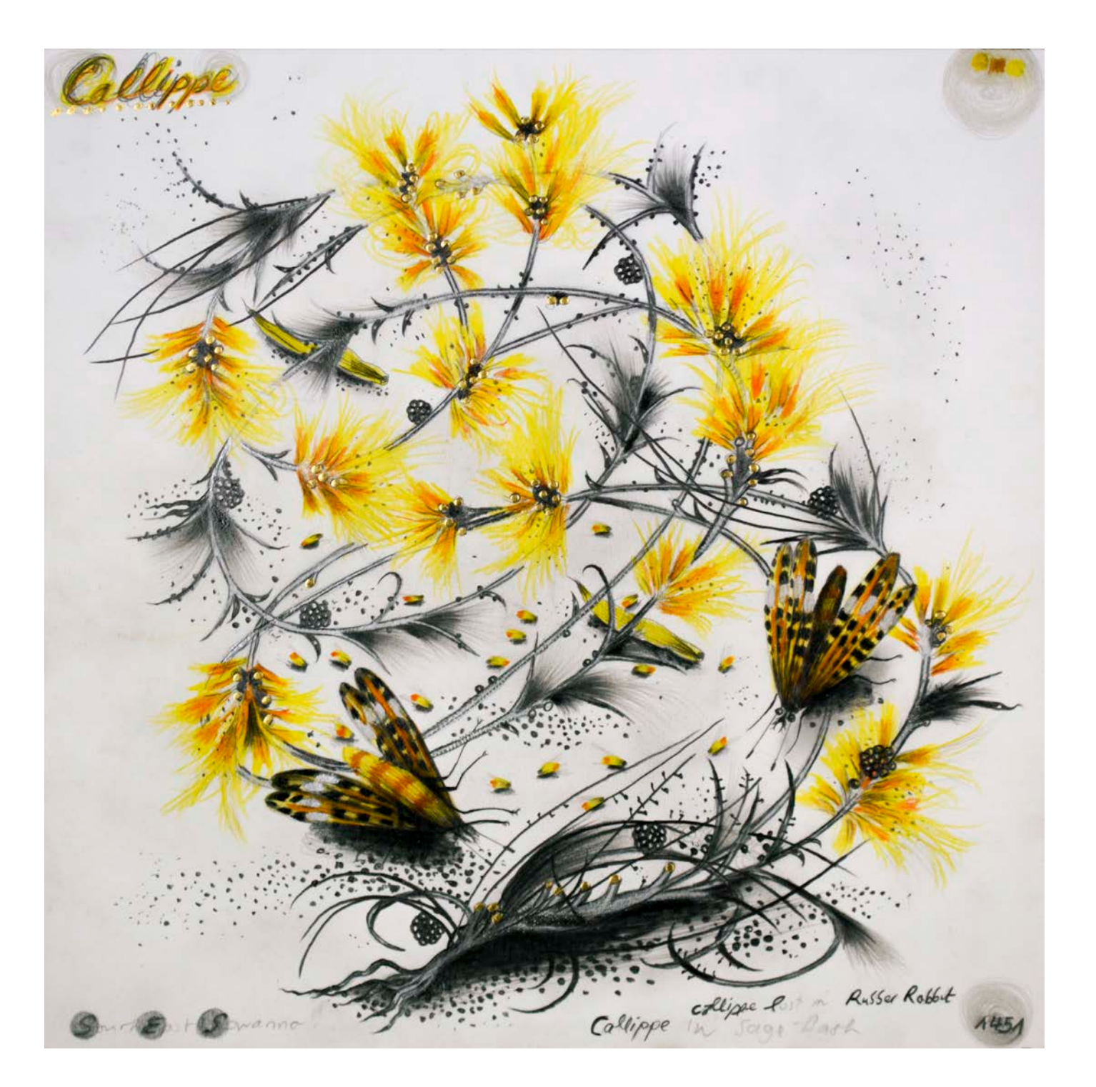
Hipkiss Callippe Lost in Rubber Rabbit, 2023 Graphite, silver ink, metal leaf and colored pencil on Fabriano 4 paper 25 x 25 cm | 9 3/4 x 9 3/4 in