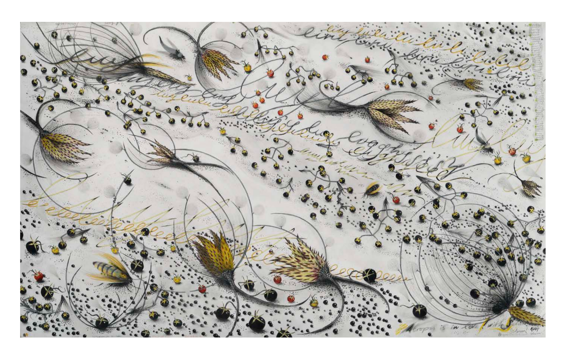
Hipkiss Atropos is in Love! With Solanum! , 2023 Graphite, silver ink, metal leaf and colored pencil on Fabriano 4 paper 60 x 100 cm | 23 1/2 x 39 1/4 in